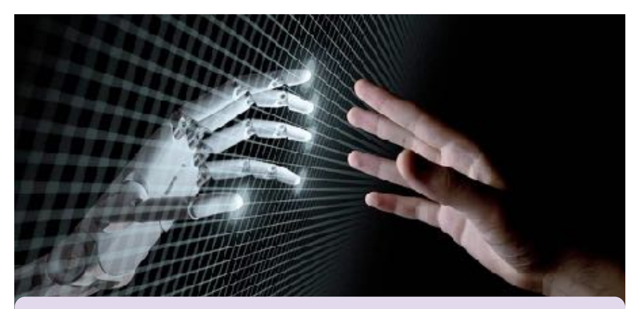
IoT power that uses insights from existing equipment, machines and production lines to improve our customers' experience.