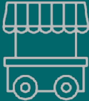
Strength of Vendor