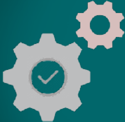
Ability to Meet Needs